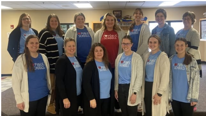
"I Love Public Schools" day staff participation photo

Please contact your child's teacher with any questions. We greatly appreciate your help with this matter. PK -- 6th Grade Teachers